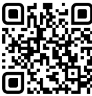
Search for it on any podcast service!

The Biggest Story Videos Featuring beautiful animation and custom sound design, The Biggest Story Videos help bring the Bible to life for children in a home or classroom setting. The videos are available to stream for free at: thebiggeststory.com/videos .